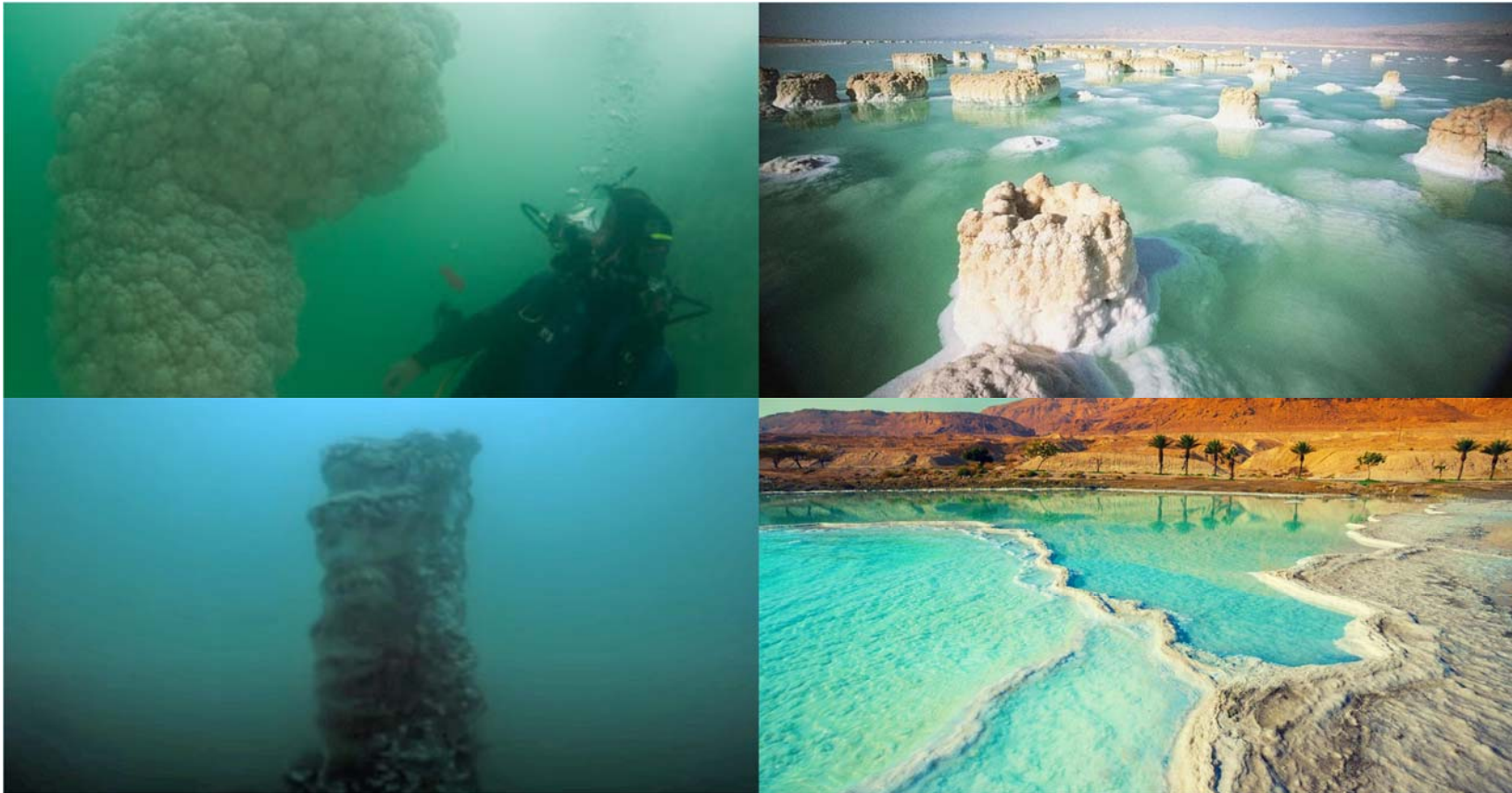
Pictured: Counterclockwise from top right, Columns of salt protruding out of the dead sea and underneath the dead sea