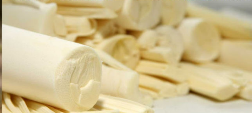
CLOCKWISE FROM TOP RIGHT: DATES, HEARTS OF PALM, PALM OIL FRUIT, COCONUT