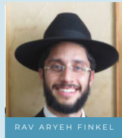
RAV ARYEH FINKEL

incur in its performance than many mitzvos de'Oreisa , because of the imperative of pirsumei nisa (publicizing the miracle): The Shulchan Aruch (O.C. 671:1) rules that a pauper must sell his garment to fund the mitzvah of ner Chanukah .