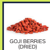
GOJI BERRIES (DRIED)