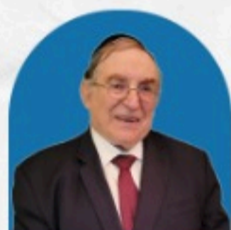
Rabbi Paysach Krohn

WATCH LIVE AT: RAISETHON.COM/TORAHANYTIME OR LISTEN LIVE BY DIALING IN 718-298-2077 X 56