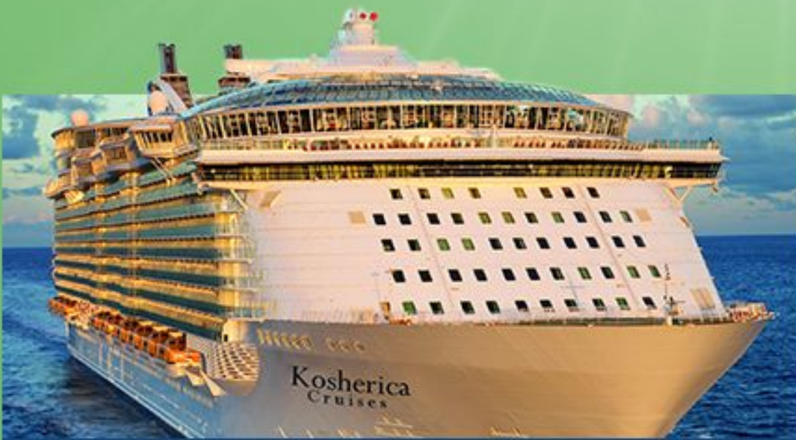
Kosherica Cruise ($15,000 VALUE!)

HOURS of TORAH LEARNING ARE AVAILABLE TO BE YOURS, FOREVER