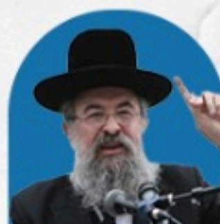
Rabbi Noach Isaac Oelbaum