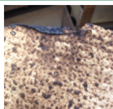
Fig. 1a: Note the two layers of matzah are touching.

In handmade matzos , the dough is rolled out manually. At