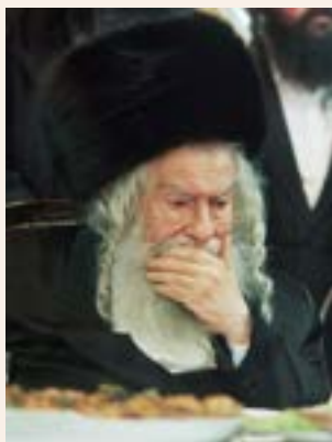
The Pnei Menachem

If we were to understand this at face value, the beis midrash seemed to have been the worst possible choice for his initial hiding place, since that is the first place where the Romans would look for him. Furthermore, how could he hope to hide in such a public place, where everyone who came to learn would see him?