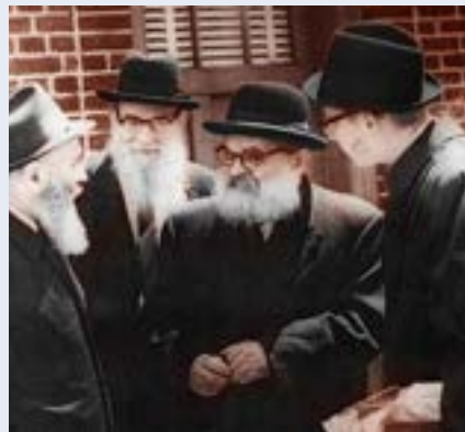
Rav Yaakov Kamenetsky