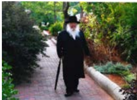
Rav Chaim Kanievsky

Moved anew, Rav Chaim repeated the goral, and the name of one of the remaining brothers emerged. With renewed blessings, they went home again, and, a short time later, they sent word that, with Hashem's help, all of the siblings were now hale and healthy. 📖